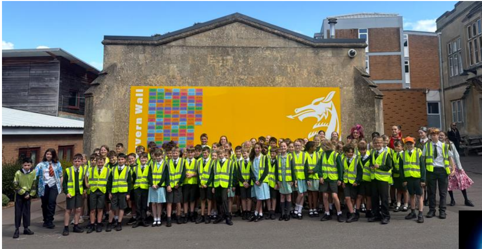
Willow & Yew Class were lucky to be invited to Queens College this morning to watch their performance of Matilda.