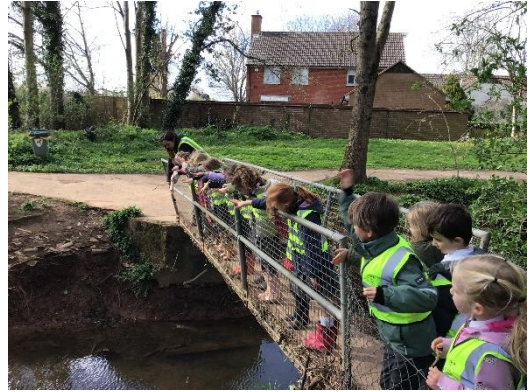
This week Beech Class went on a Welly Walk looking for signs of animal life.